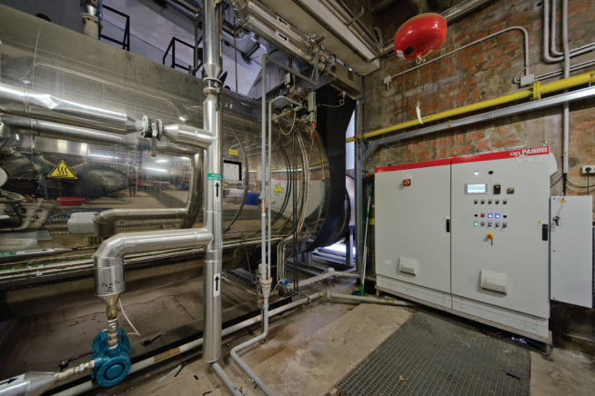
A Capstone C1000 system saves the facility about €300,000 per year.