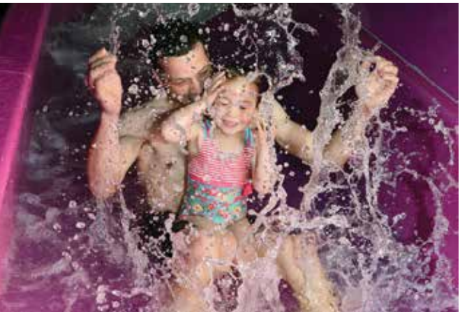
The ONE NK Leisure Centre now saves about 10 percent of their utility costs.